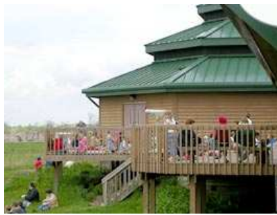
Horicon Marsh International Education Center

Gromme Prints. Owen Gromme's print Requiem Horicon Marsh, 1916-1976 , helped CNRA raise funds for the "goose wars" in the late 1970s. Since then it has helped support our grant programs and raised funds for building the Horicon Marsh International Education Center. In 2009 CNRA transferred the remaining prints to the Friends of Horicon Marsh to be sold in the Center's gift shop. Future sales will support programs by the Friends.